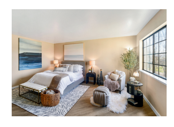
OFFERED AT $586,888

1 BEDROOM • 1 BATHROOM • 1,012 SQ FT • 1-CAR GARAGE